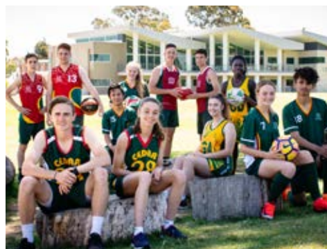
▼ Interschool sports competitions