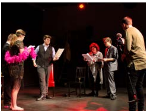
▼ Senior School drama production