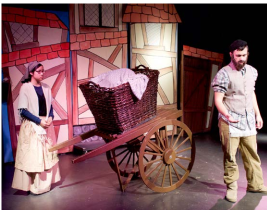
▼ Senior School production of "Fiddler on the Roof".