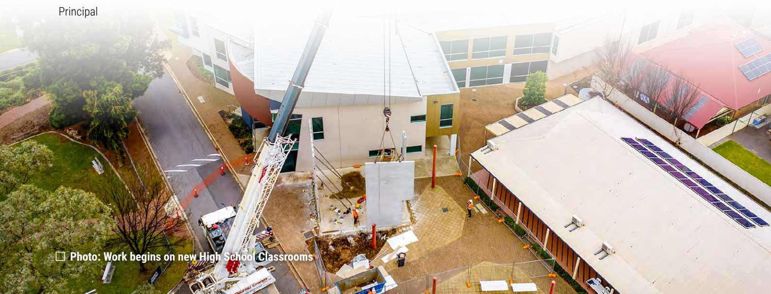
Photo: Work begins on new High School Classrooms