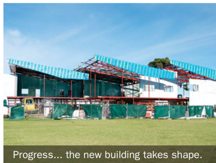
Progress... the new building takes shape.

Plenty of natural light will make the new facility a great place in which to work and learn, as will the inspiring views across the school oval to the hills. A glass northern façade will make effective use of winter sun to minimise heating costs.