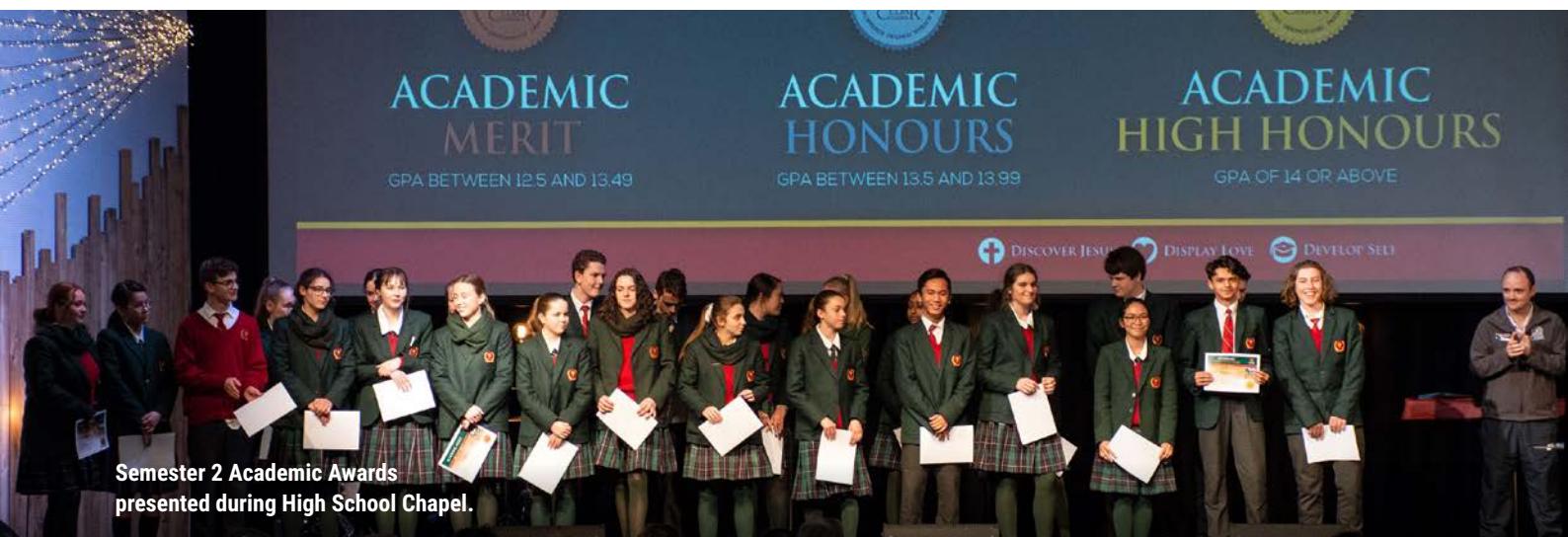
Semester 2 Academic Awards presented during High School Chapel.